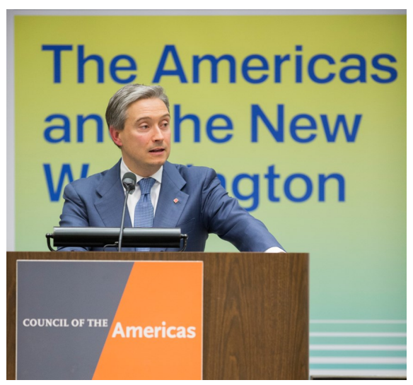
Canadian Minister of International Trade François-Phillipe Champagne

Topics of priority interest and discussion included trade relations with a focus on Mexico and Canada, Venezuela's humanitarian crisis, corruption and political uncertainty in Brazil, Colombian peace, and finding a workable path forward for private-sector led development in Central America. Explaining the new Washington and political shifts in the United States overlay the entire agenda.