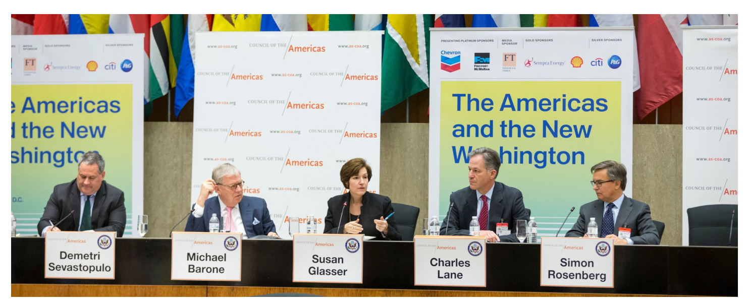
Panel of journalists discuss "The New Washington: What Comes Next"