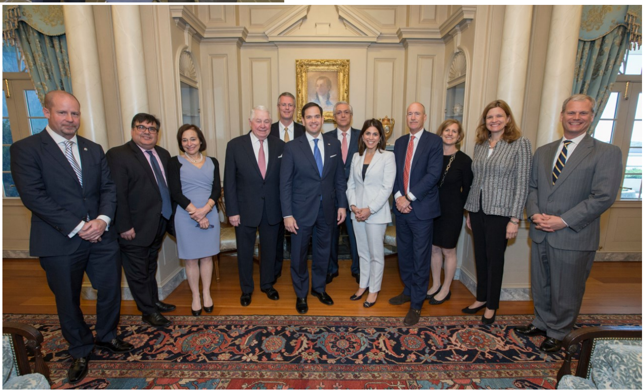
The conference sponsors with Senator Marco Rubio and COA staff.

Conference participants came away with a much more informed and nuanced position of Administration policies and personalities, and a better understanding of ways to promote priority issues and interests.